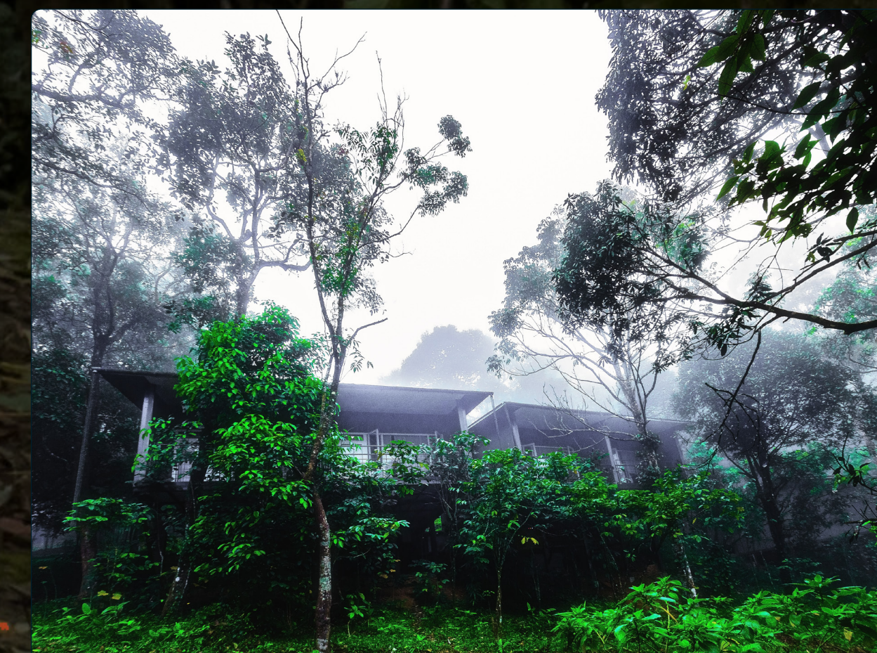
CGH EARTH WAYANAD WILD