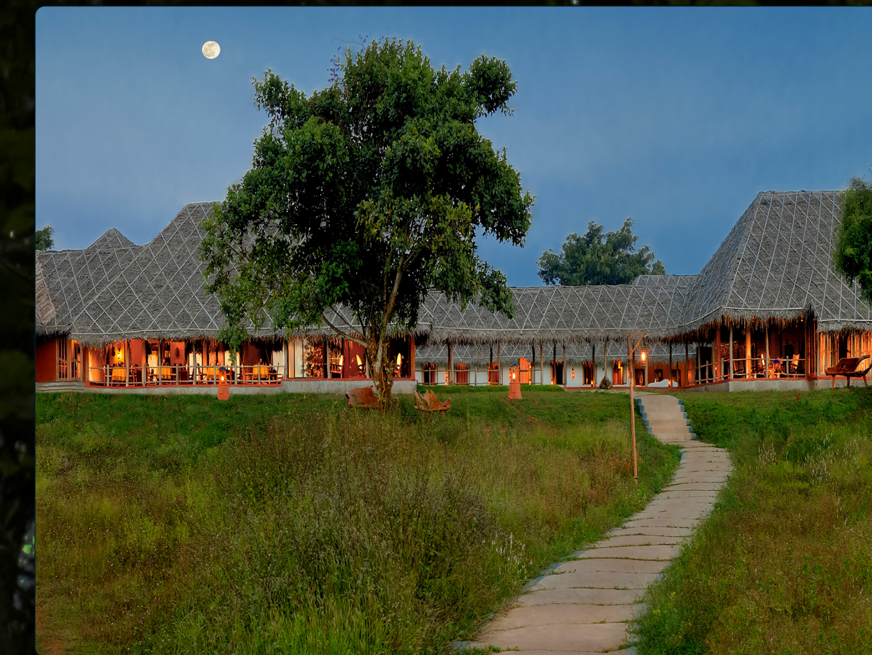
EVOLVE BACK KURUBA SAFARI LODGE