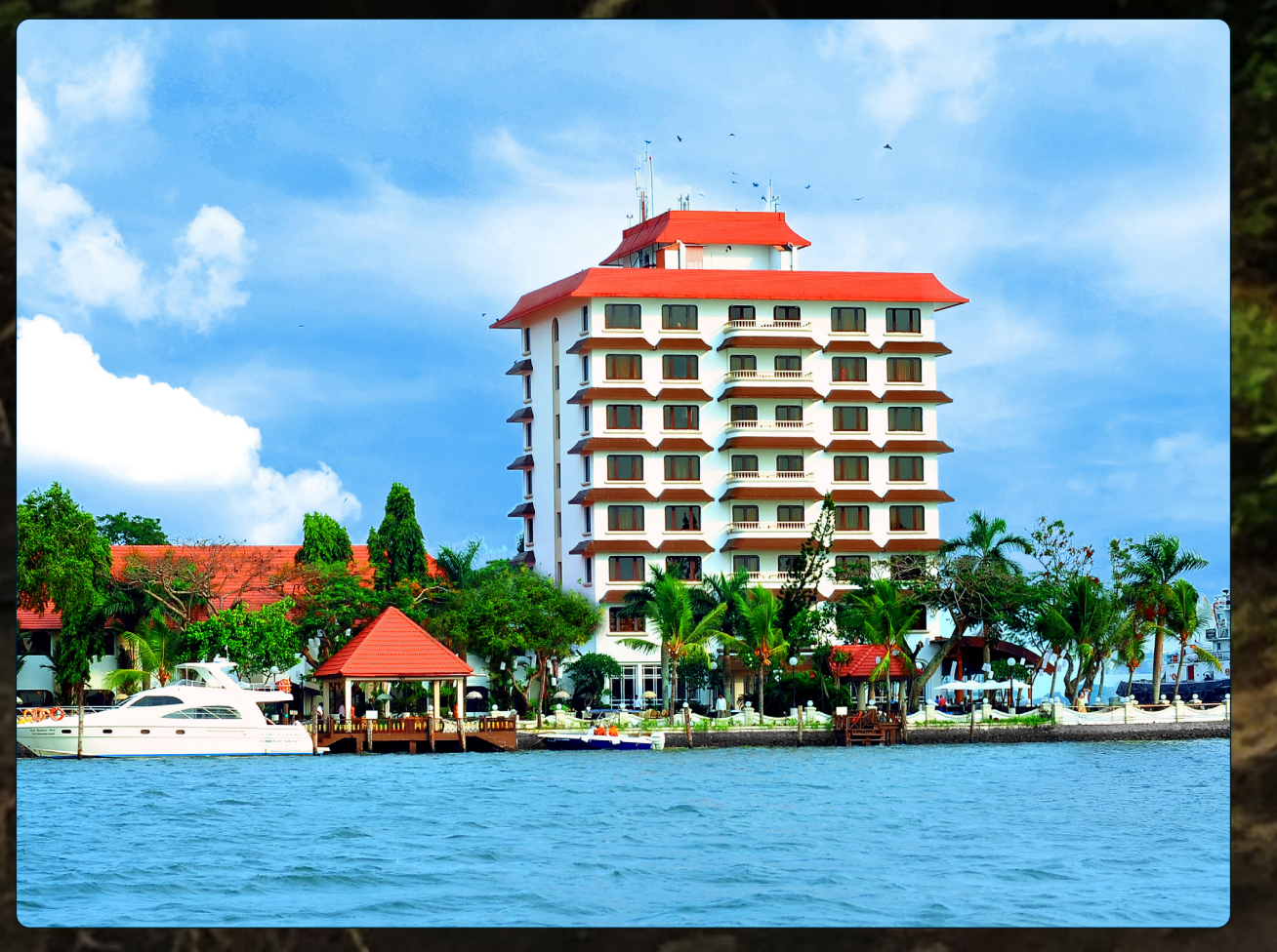
TAJ MALABAR RESORT & SPA