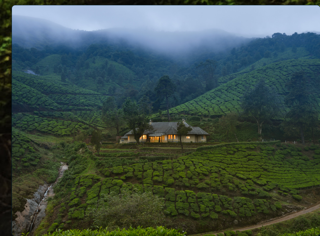
AMA STAYS AND TRAILS BUNGALOWS