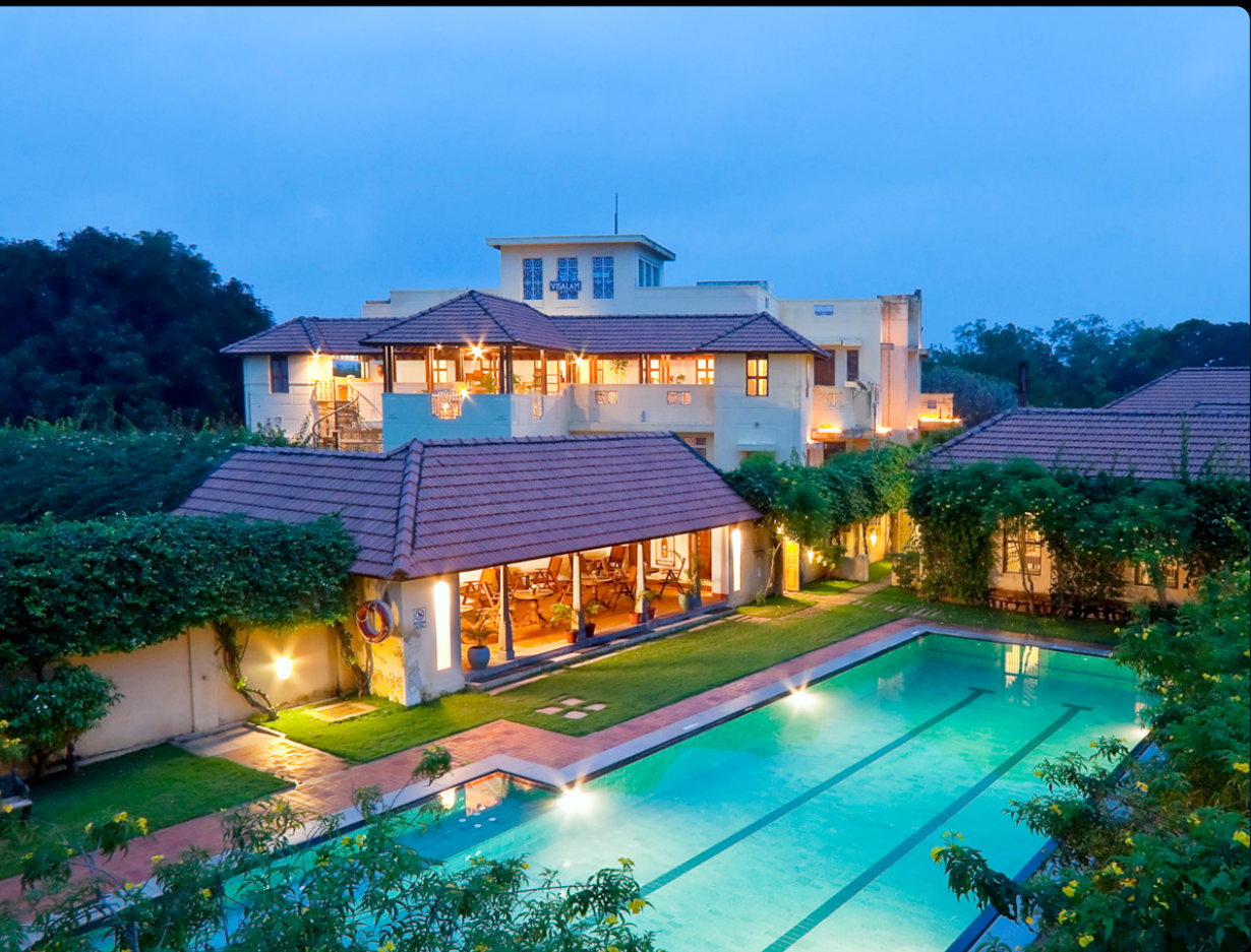
CGH EARTH VISALAM