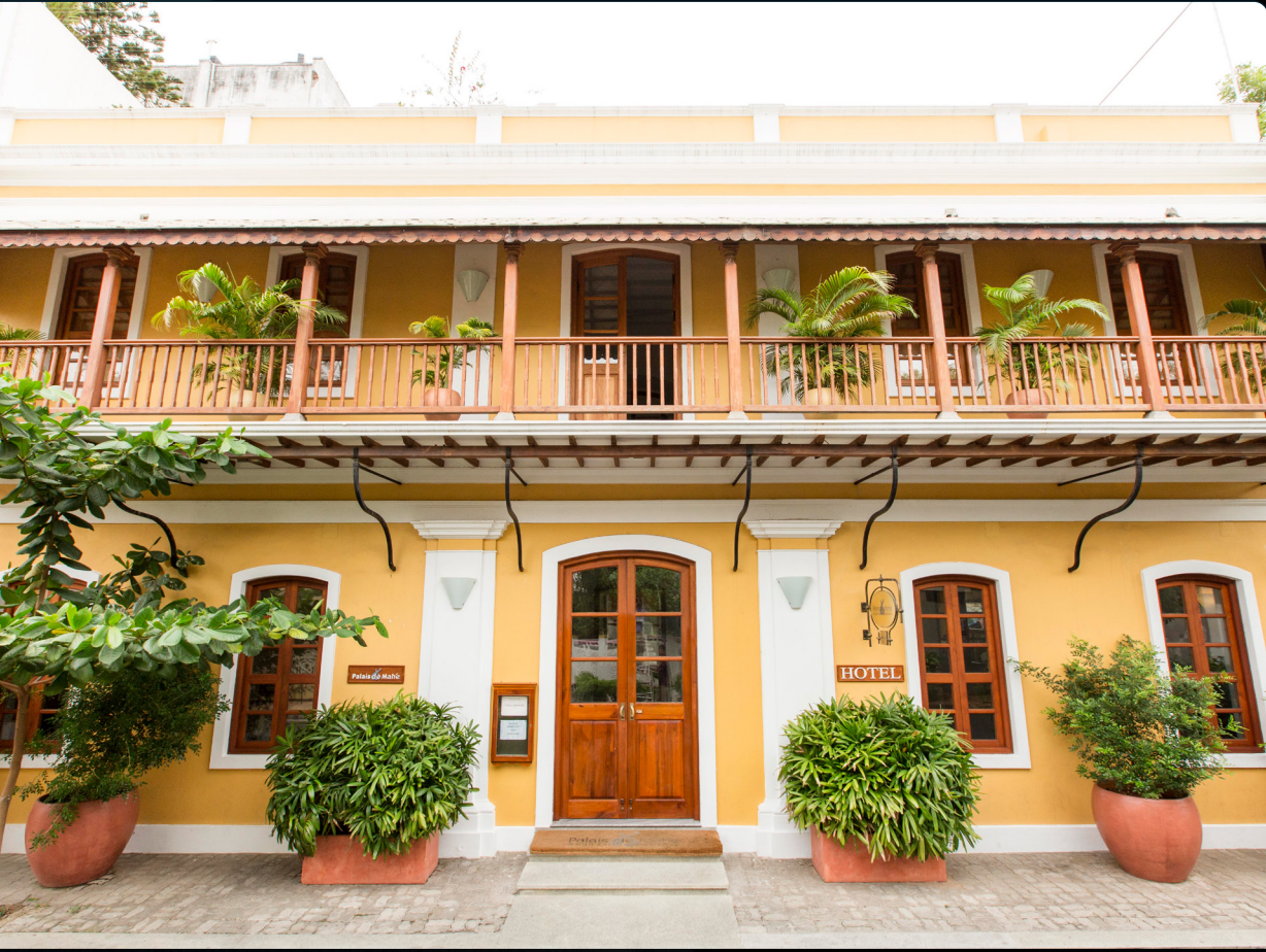
CGH EARTH PALAIS DE MAHE