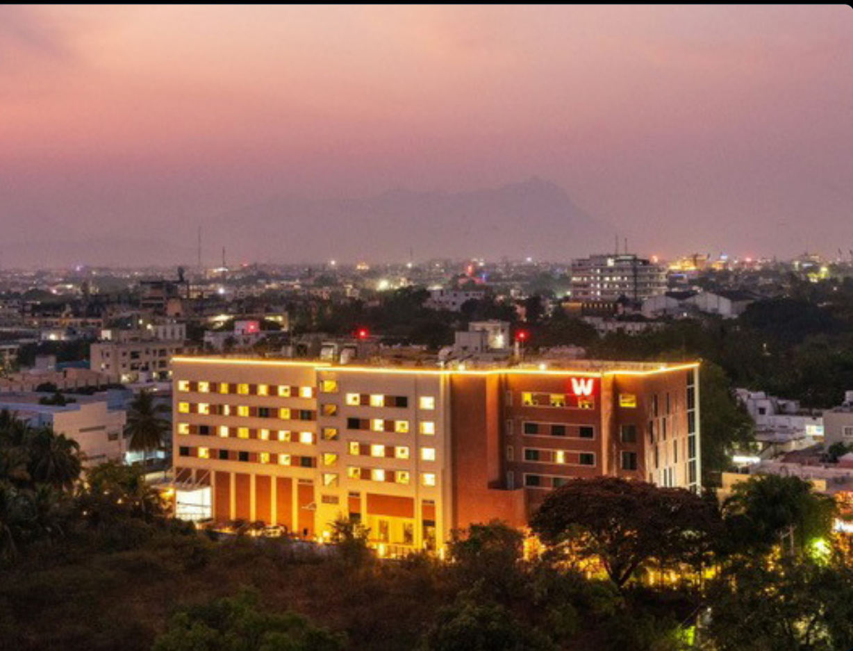
WELCOMHOTEL BY ITC HOTELS

The Taj Fisherman's Cove Resort & Spa beach resort in Chennai is built on the ramparts of an old Dutch Fort. It offers seaside hospitality with rooms, cottages, and villas designed for relaxation and rejuvenation, set in lush, manicured gardens with breathtaking sea views.