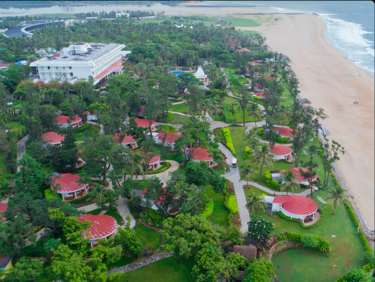
TAJ FISHERMAN'S COVE RESORT & SPA