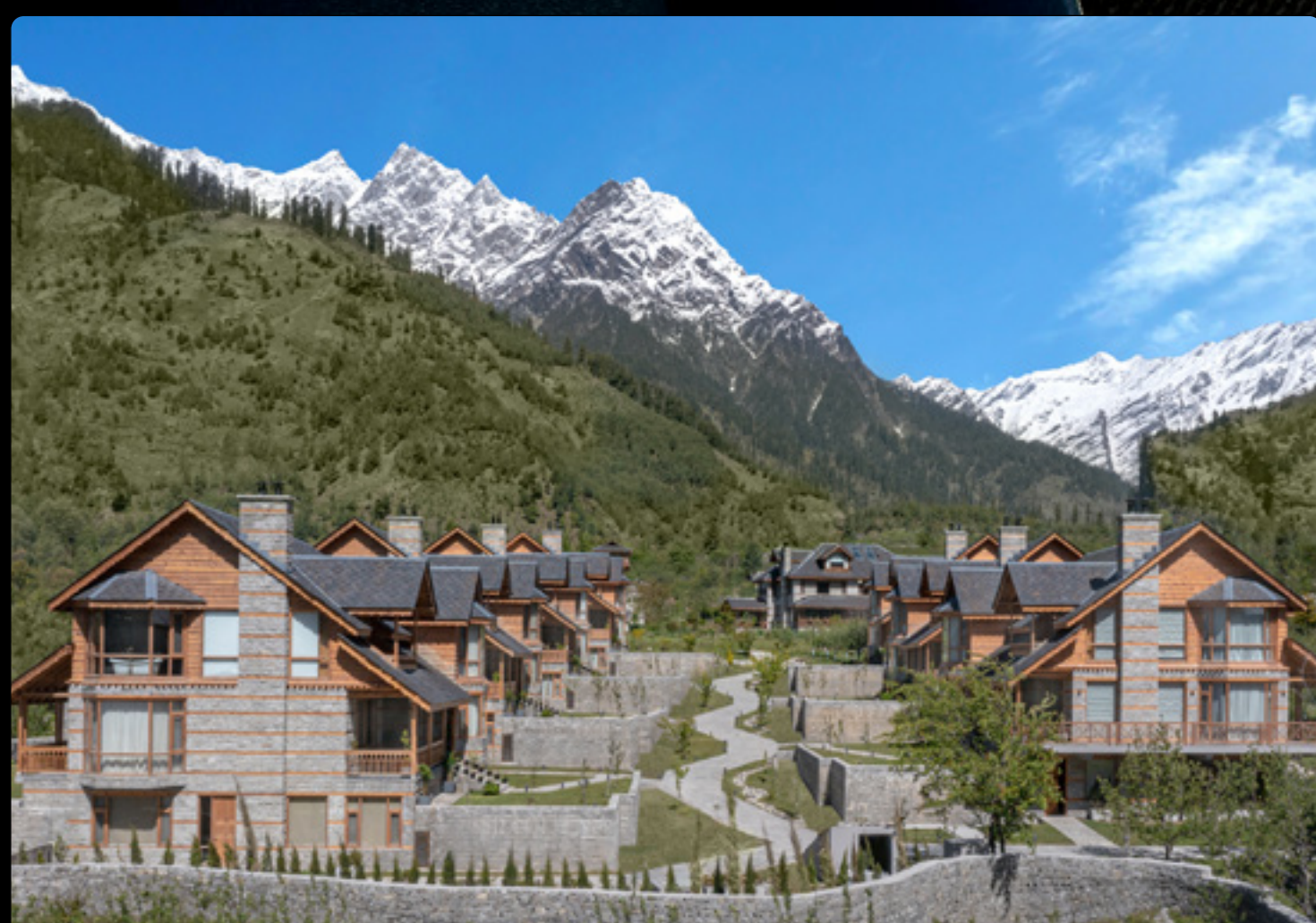
Welcomhotel by ITC Hotels Hamsa