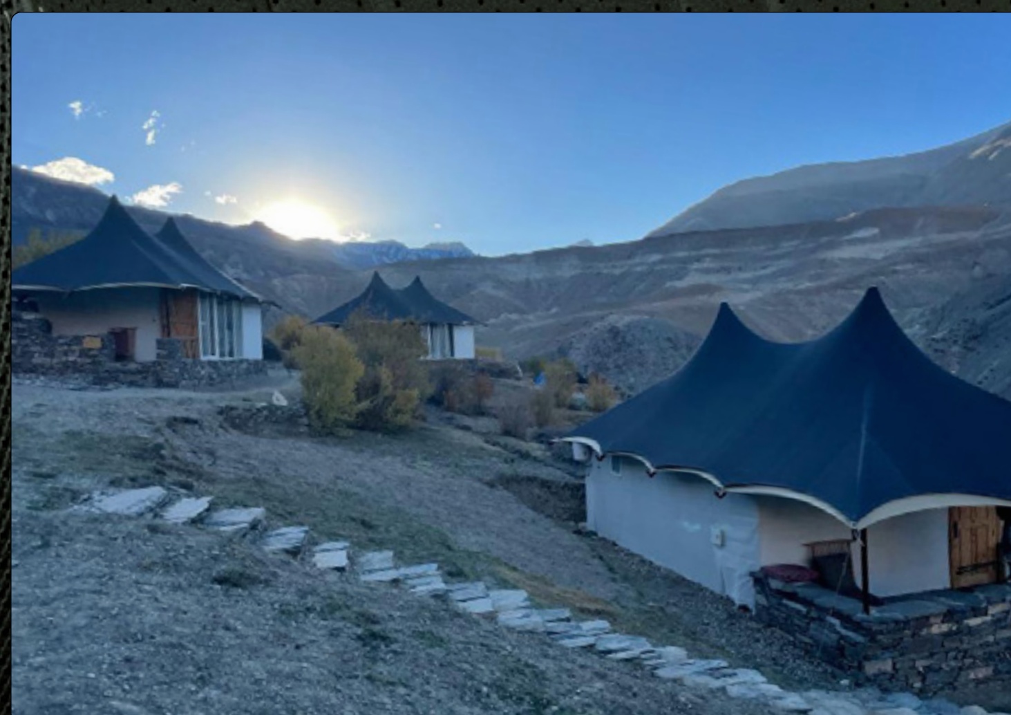
Tara Mountain Sarai