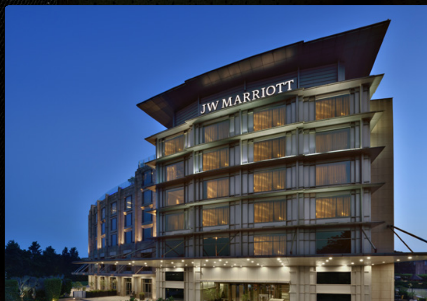
JW Marriott Chandigarh