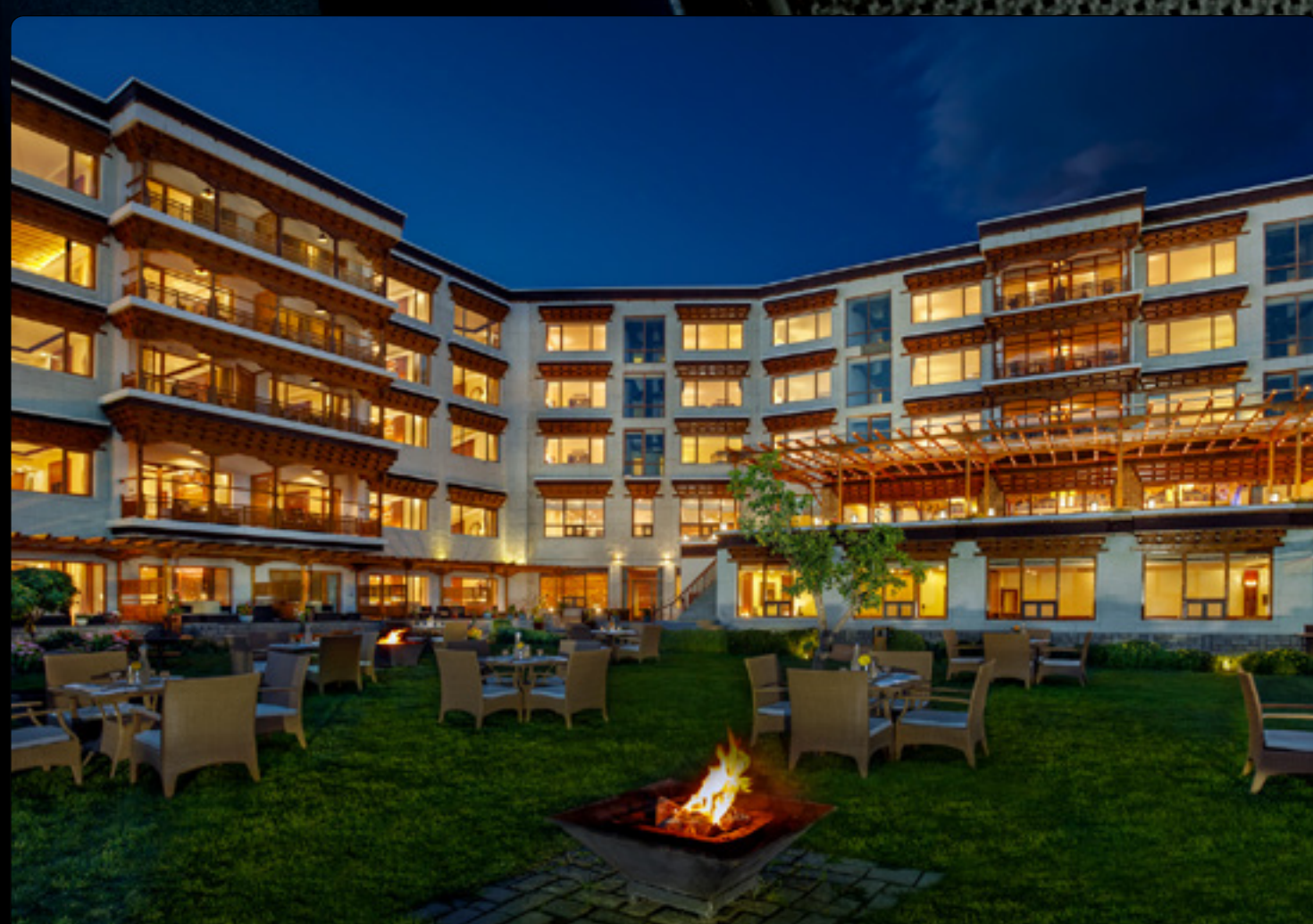
The Grand Dragon Ladakh

Luxury 5-star hotels and boutique properties