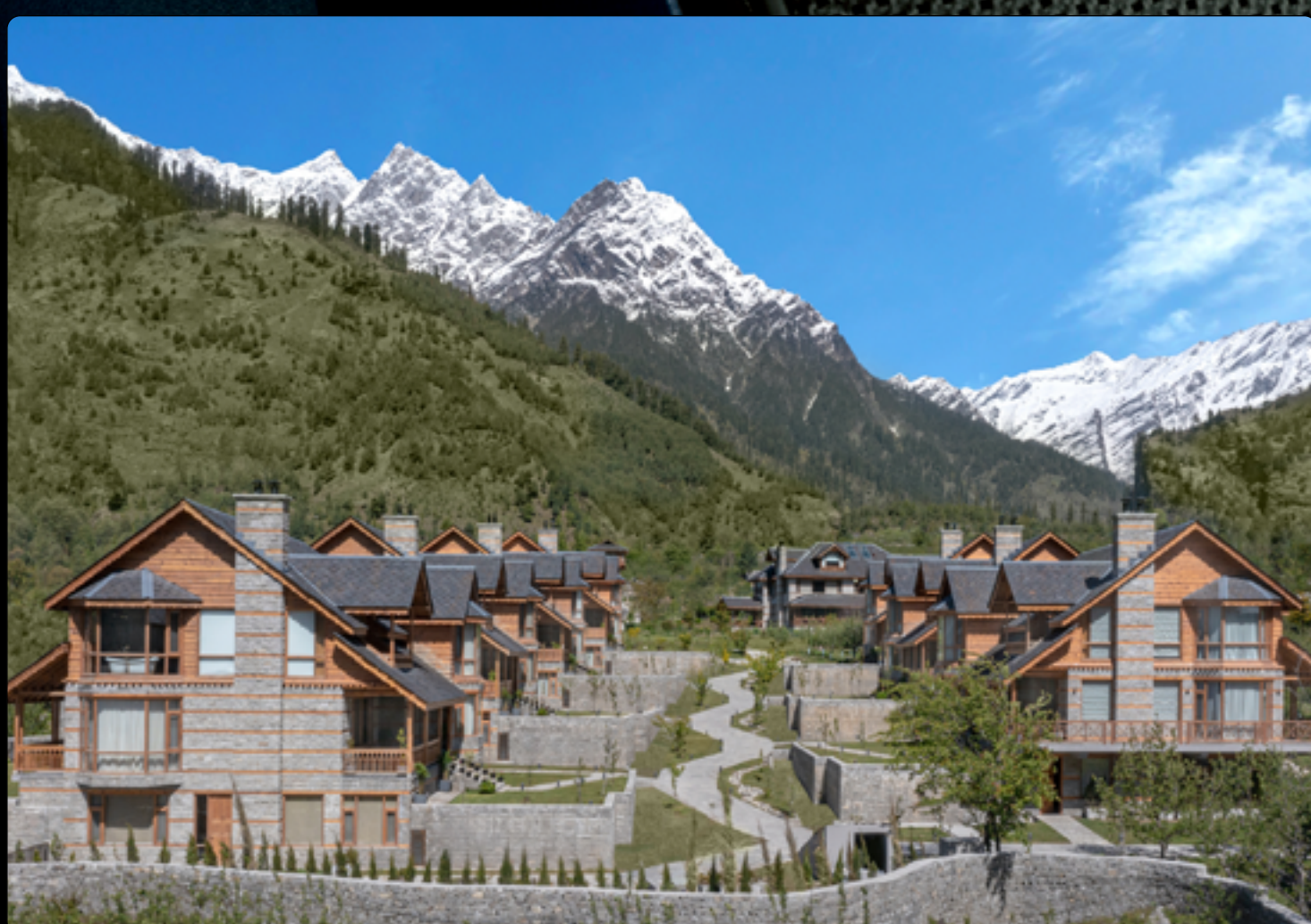
Welcomhotel by ITC Hotels Hamsa

Luxury 5-star hotels and boutique resorts