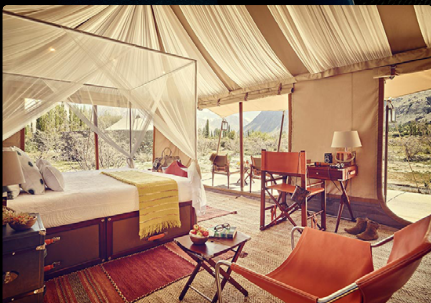
TUTC Chamba Camp Diskit