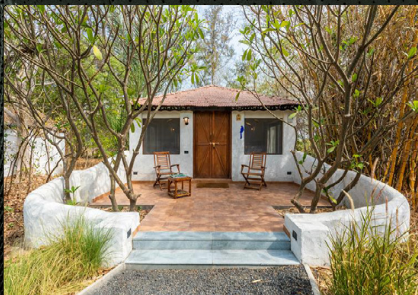
Rann Riders Eco Lodge