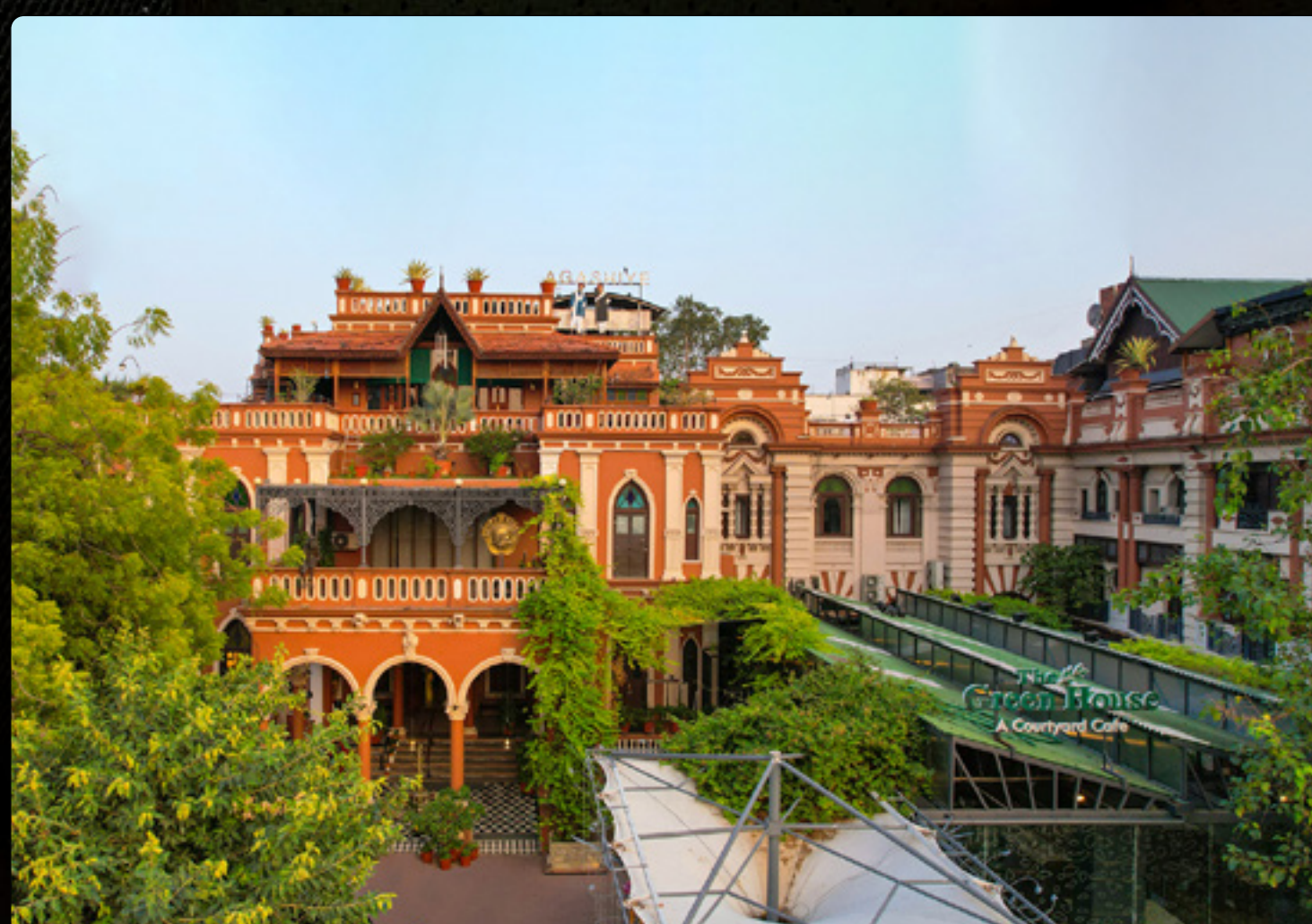
The House of MG