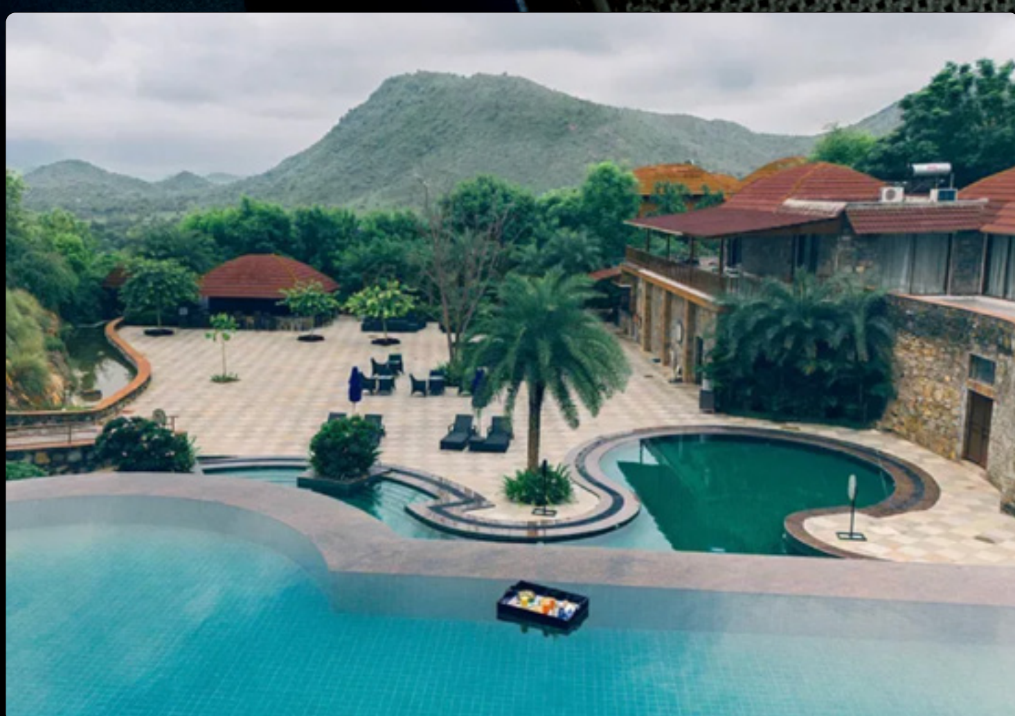
The Ananta Udaipur