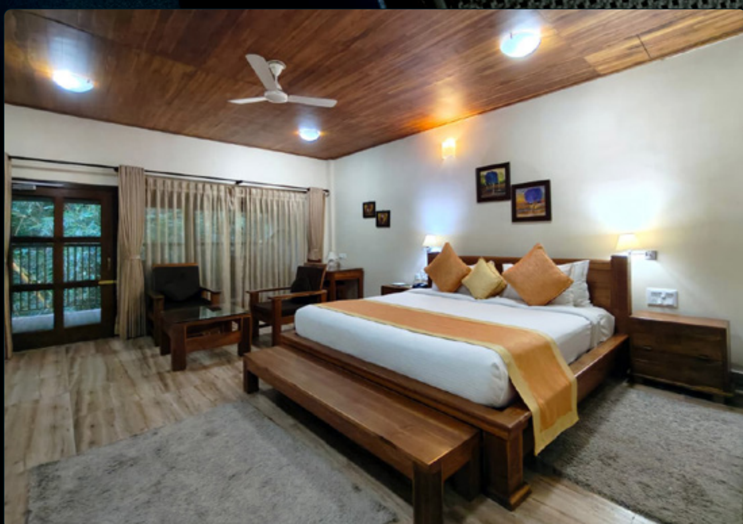
Resort Borgos Kaziranga