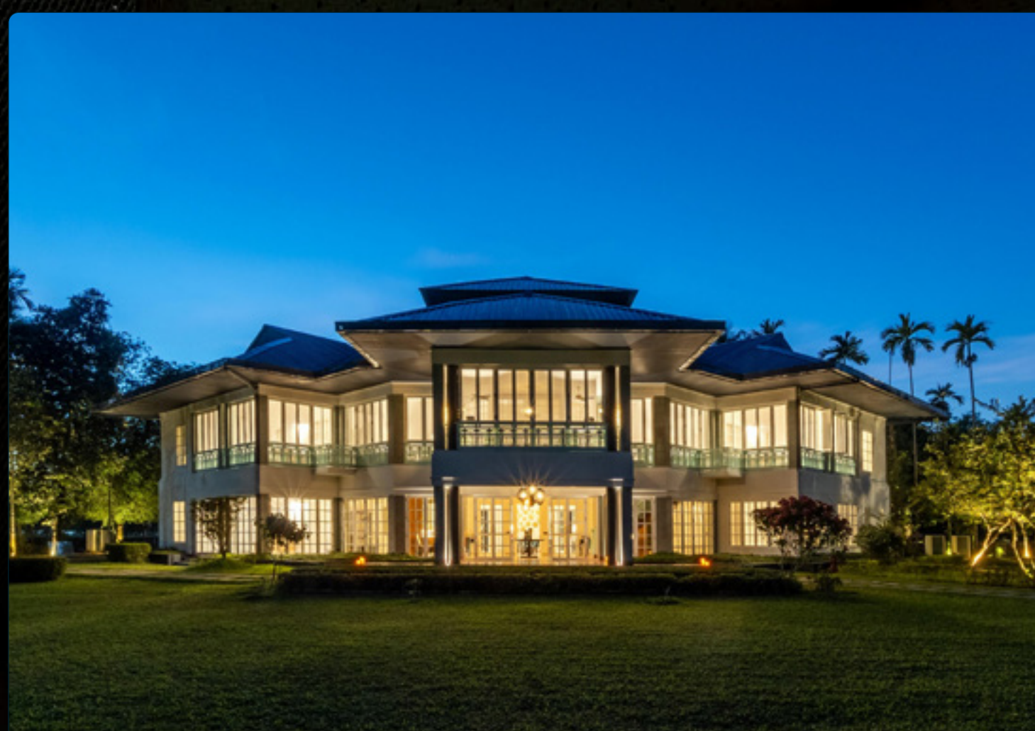
The Postcard in the Durrung Tea Estate