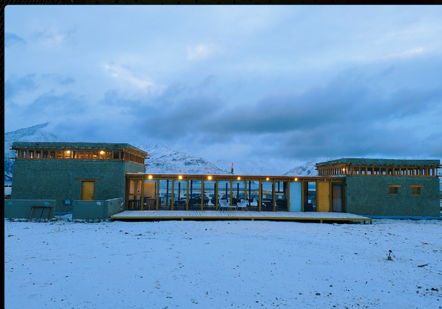
The Merak Pangong