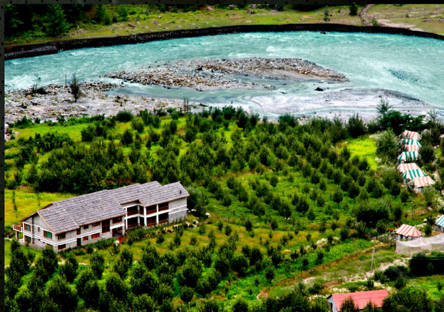
Banjara Valley Retreat