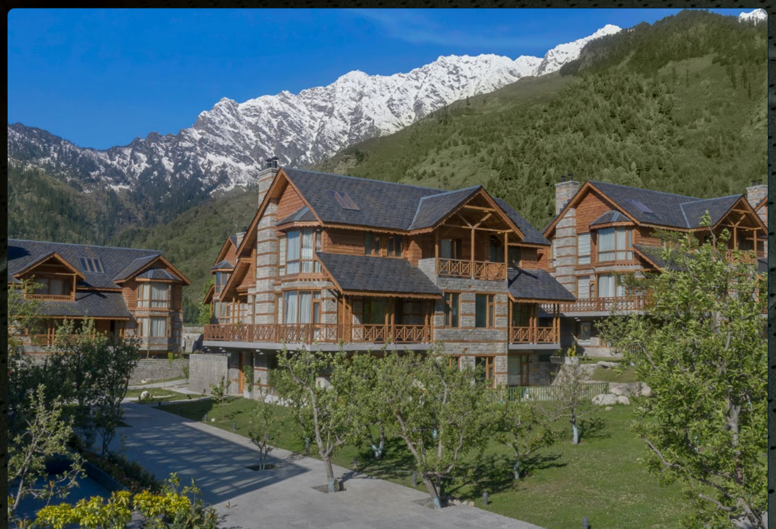
Welcomhotel by ITC Hotels Hamsa