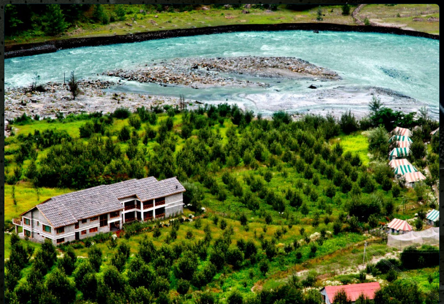
Banjara Valley Retreat