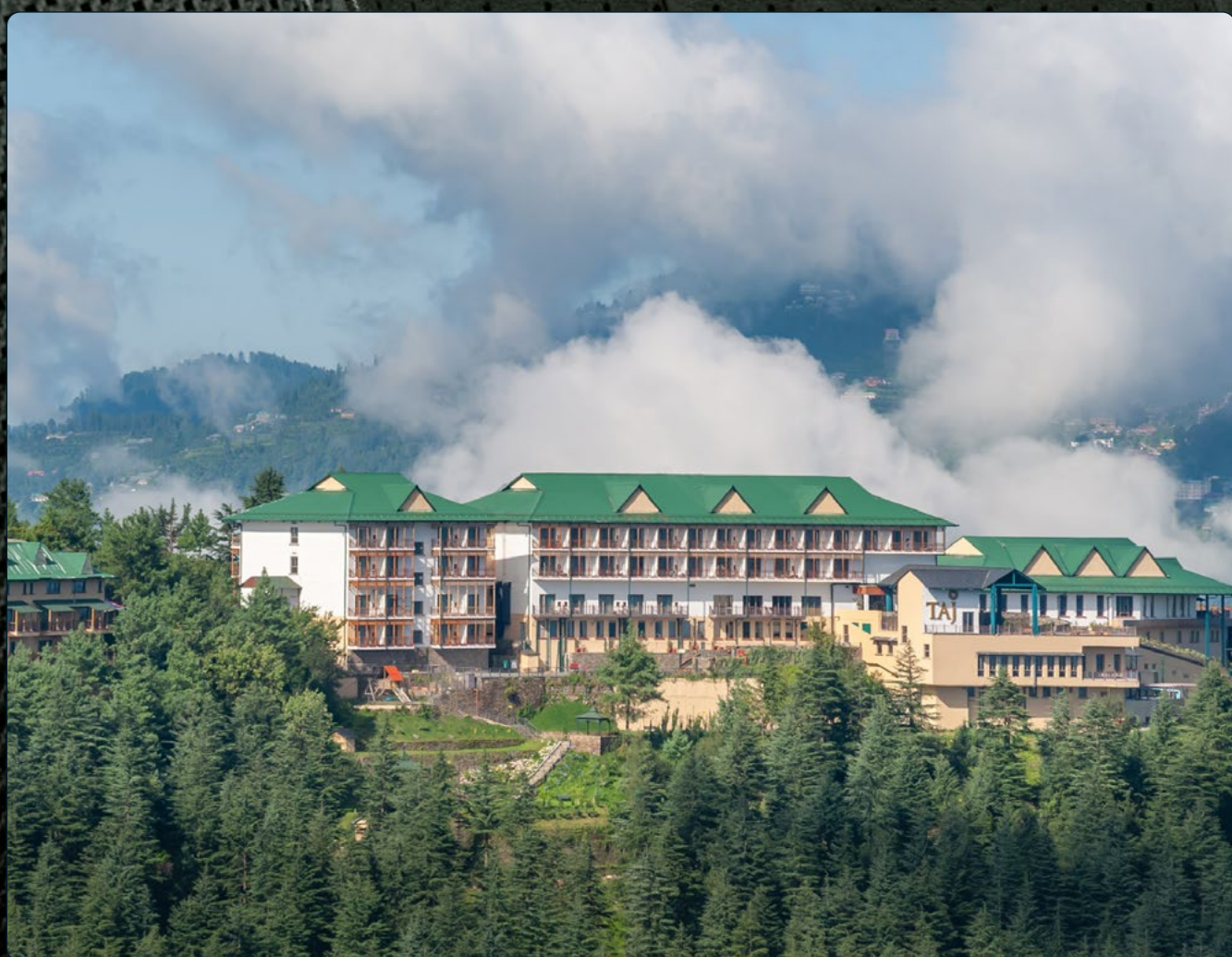
The Taj Theog Resort & Spa

Luxury 5-star hotels, boutique retreats, and eco-friendly accommodations