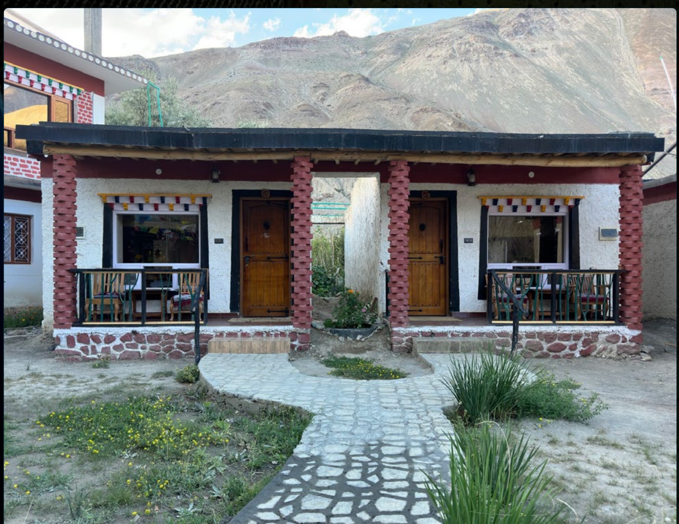
Spiti Mud Huts Tabo