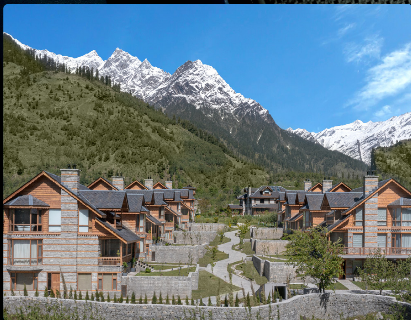
Welcomhotel by ITC Hotels Hamsa

Luxury 5-star hotels and boutique retreats