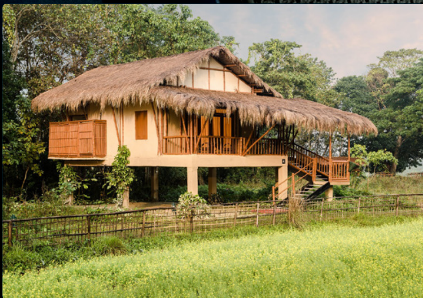
Diphlu River Lodge