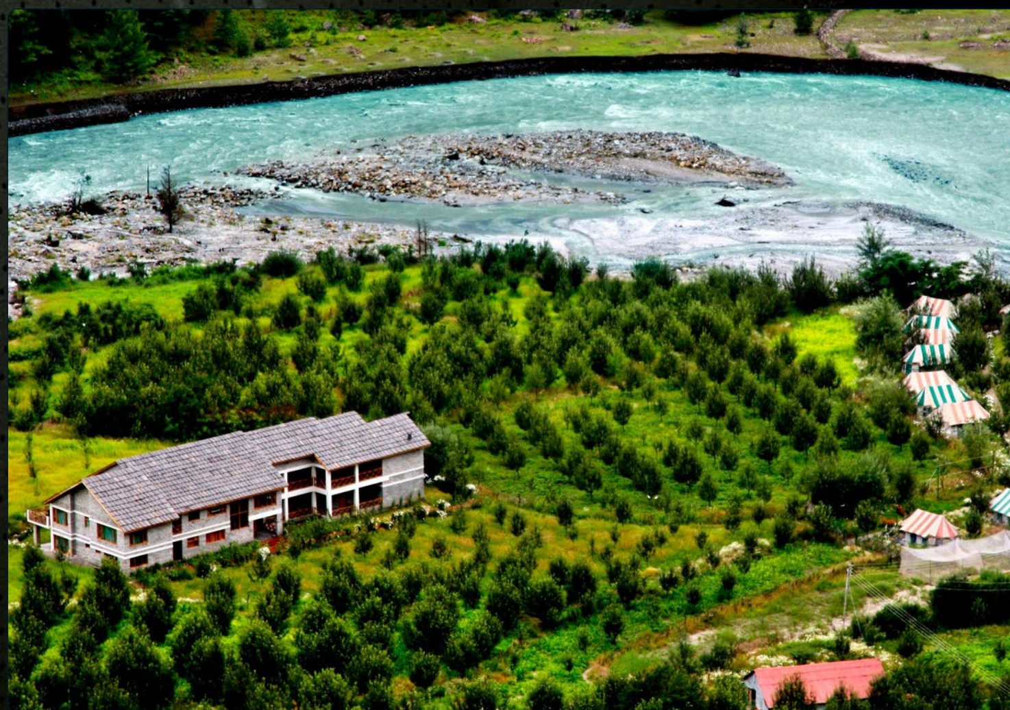
Banjara Camps & Retreat