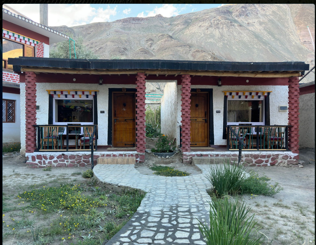
Spiti Mud Huts