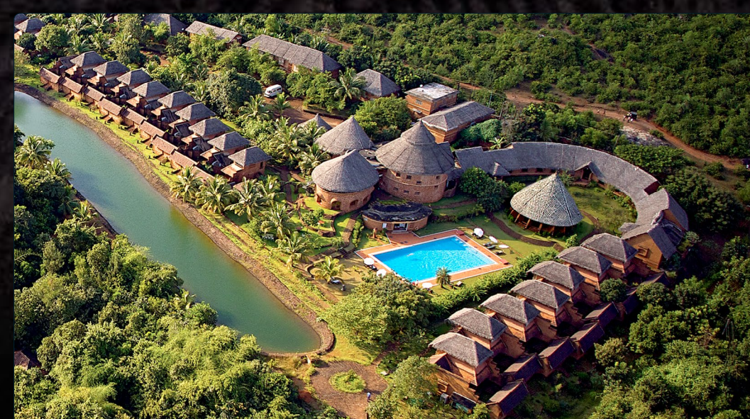
CGH Earth, SwaSwara