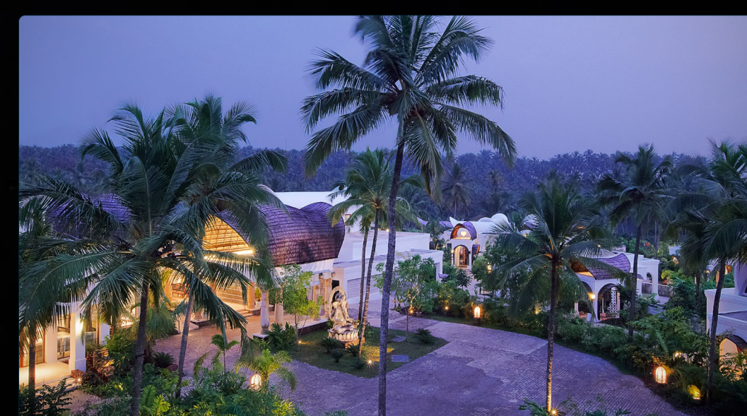
Taj Bekal Resort and Spa