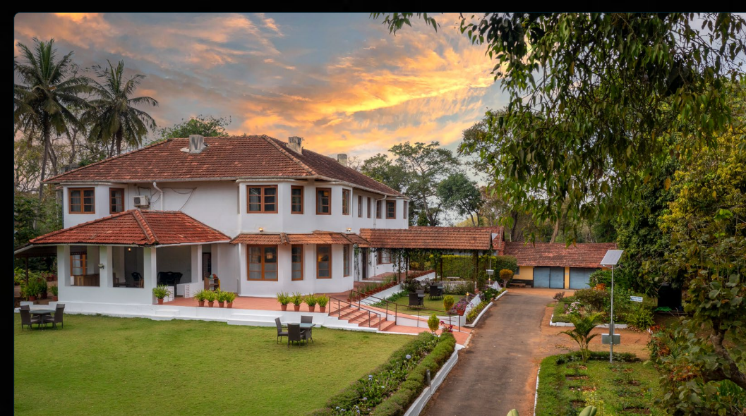
Ama Stays and Trails Coffee Plantation Heritage Bungalows